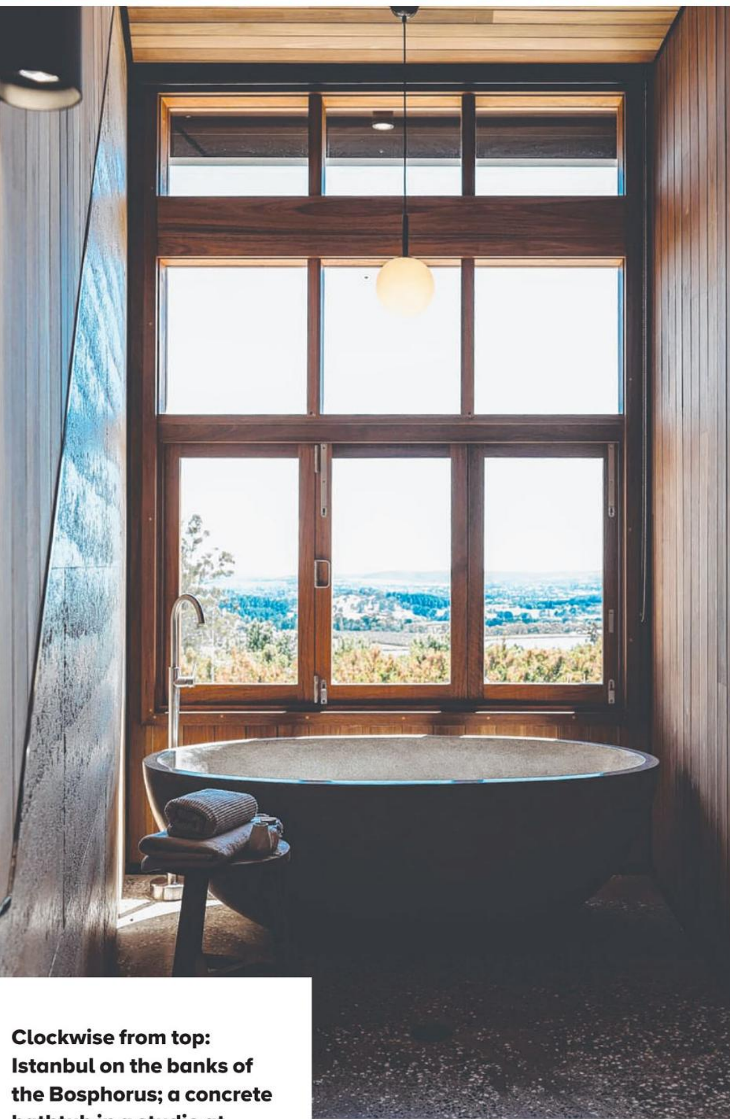
Clockwise from top: Istanbul on the banks of the Bosphorus; a concrete bathtub in a studio at Basalt in Orange (below); hiking in the snow at Club Med Kiroro Grand; a sandal workshop with Rome Cavalieri.