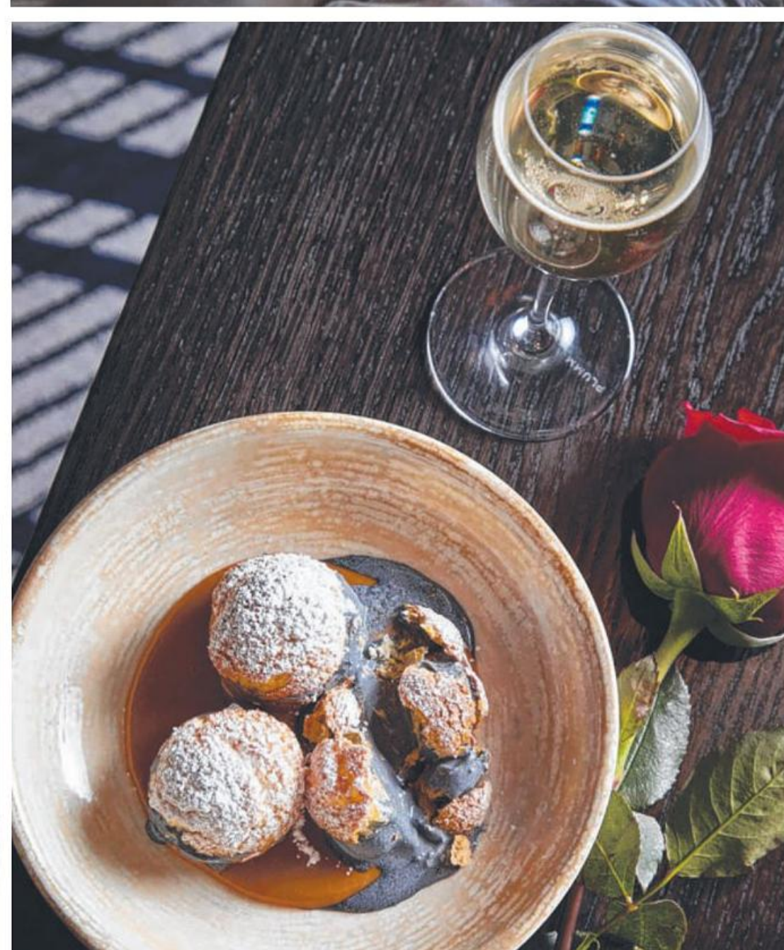
From top: Indian Pacific passing Lake Hart and one of its Gold Cabins; "The Grey Stuff" dessert on the Beauty and the Beast menu at Luke's Kitchen; The Wilmot Bar at the Kimpton Margot; a room at Ryse Hotel Seoul.